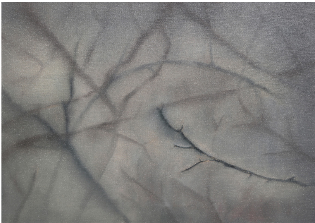
Sin título #32 , 2020-2022, huile sur toile, 35 x 45 cm