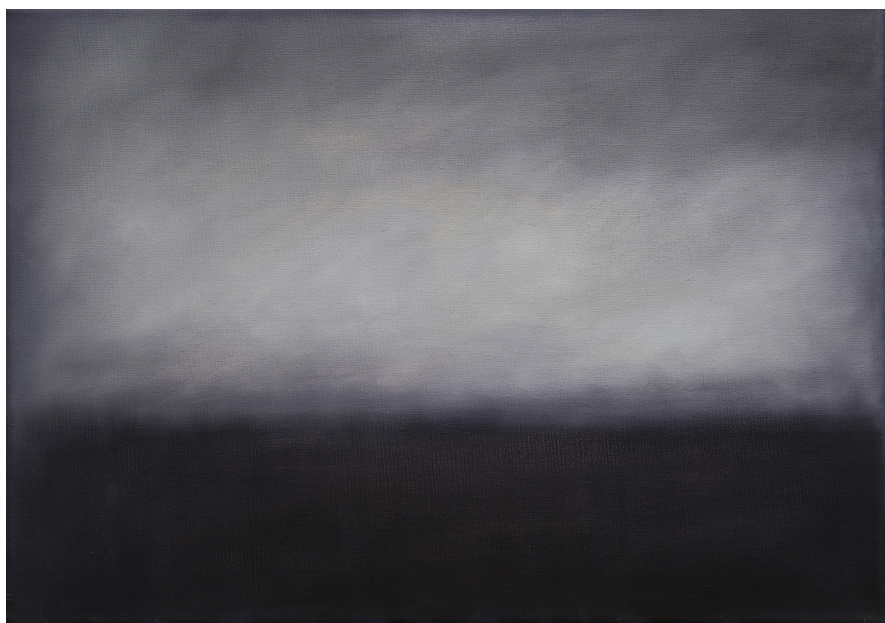
Donde nunca haya estado #29, 2020-2022, oil on canvas, 35 x 45 cm