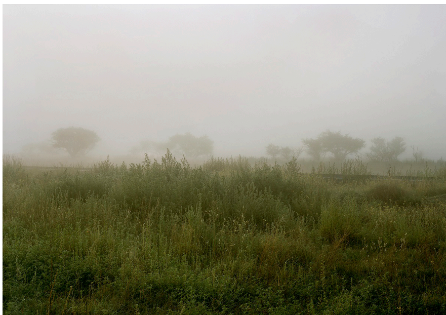
Paisaje I, Bruma series, 2011, inkjet print on cotton paper, 150 x 185,3 cm