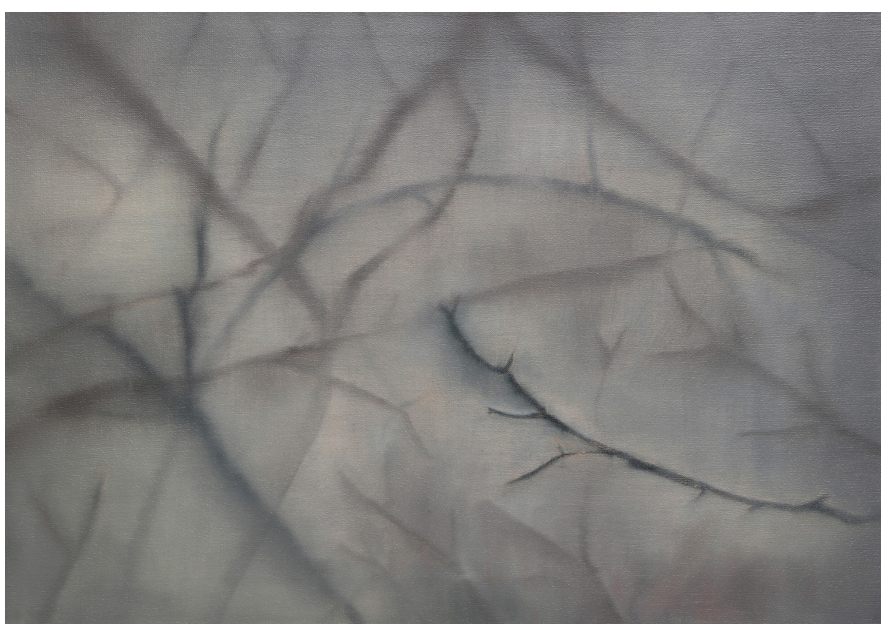
Sin título #32, 2020-2022, oil on canvas, 35 x 45 cm