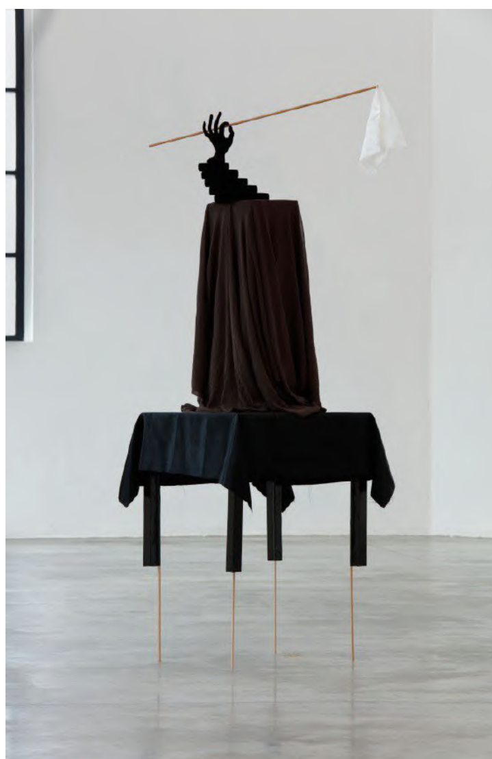
Kateřina Vincourová, Enchantress of Peace , 2016