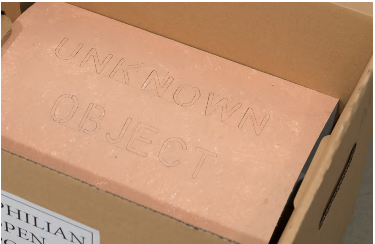
Milan Adamciak, Panphilian open post / Unknown Object , 2016