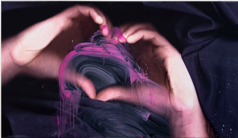
Untitled, 2025, oil on Inkjet print on vinyl.